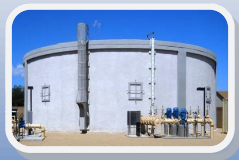
Brisas Well Site

The City of El Mirage conducts extensive monitoring to guard against contaminants in the drinking water according to federal and state laws. The state of Arizona requires monitoring for certain contaminants less than once per year because the concentrations of these contaminants are not expected to vary significantly from year to year, or the system is not considered vulnerable to this type of contamination. All detected contaminants were below the maximum contaminant level in the drinking water. There were